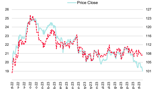
Supalai (SPALI TB)